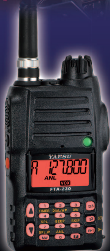
Pro Series FTA-230