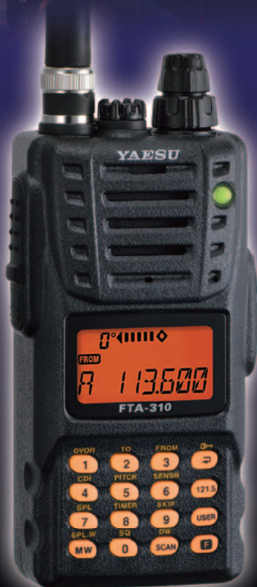
Pilot Series FTA-310